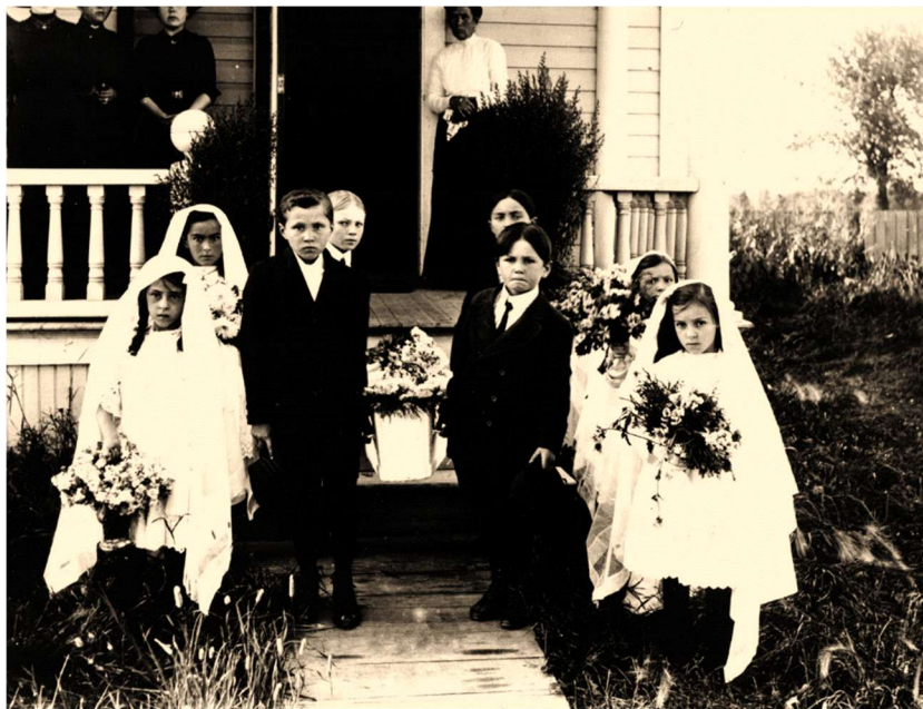
A shocking reminder of death and funerary traditions in Manitoba history – here young pallbearers and attendants pose with the coffin of one of their own – also a young child, presumably cut down by one of the typical epidemics of the day – perhaps diphtheria or scarlet fever. The faces are grim, tense, wary – for even as youngsters, they would know that this could also be their fate.

The popularity of Romanticism was to find its perfect accompaniment in terms of funerary traditions with the death of the royal consort, Prince Albert, in December of 1861, said at the time to be due to typhoid, although recent research suggests cancer or Crohn's disease. Queen Victoria, then 42 years old, was devastated by the loss, and spent the rest of her long life in mourning, often in seclusion and always dressed in black. Her deep-felt and encompassing reaction to Albert's death fully embraced prevailing Romantic attitudes, and was raised to the highest levels by the nobility, and especially by the growing middle classes, which sought to emulate their high-born "betters." And these responses came to affect every aspect that could be associated with a death – from funeral-announcements cards and obituaries, to coffins, hearses and processions, to elaborate gravemarkers. The Victorians brought their enormous curiosity and ingenuity to bear on even the smallest details, and a smothering etiquette also came to attend all of this activity. All of these developments are recounted and explored in many of the entries that follow.