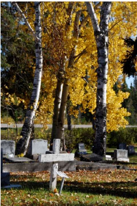
The 2002-05 cemetery inventory took in many cemeteries in northern Manitoba – at Thompson, Flin Flon, Nelson House, Norway House, Grand Rapids and The Pas, whose Lakeside Cemetery is featured here.

This project has its origins in a major survey of cemeteries and gravemarkers undertaken by the authors between 2002 and 2005. One hundred and nineteen of the province's major community and church cemeteries, as well as 93 small and obscure burial grounds (thus to a total of 212 graveyards*), were visited over those four years. And more than 8,000 gravemarkers were photographed and catalogued as the primary objective of that initiative. This comprehensive and detailed inventory allowed us to explore nearly every possible gravemarker form, style and material used in Manitoba over the past 150 years. The inventory also allowed us, with great confidence, to identify major cultural and religious themes, as well as special and unusual examples. Ancillary historic funerary subjects also came into focus – cemetery designs, gravemarker symbolism, and epitaphs. The 125 subjects presented in this current project are just the most interesting and expressive of this vast and fascinating subject.