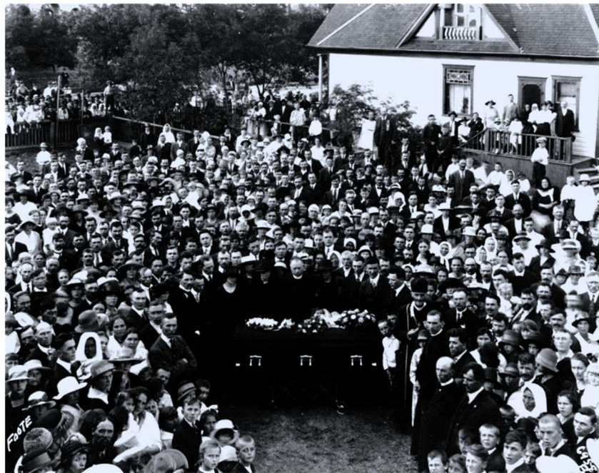
A funeral at Sts. Vladimir and Olga Ukrainian Catholic Cathedral, September 6 th , 1920. (Archives of Manitoba) The enormous crowd arrayed around the coffin—which may have been for a member of the clergy—is astonishing to contemporary eyes.

Two final observations for those interested in their own investigations of Manitoba gravemarkers and cemeteries: The opening sections of this introduction imply the need for a guidebook to fully appreciate the various symbols that appear on many Manitoba gravemarkers. Some useful materials are available on-line, and a book entitled Stories in Stone. A Field Guide to Cemetery Symbolism and Iconography (Douglas Keister, Salt Lake City, Utah: Gibbs Smith Publisher, 2004) is an excellent resource. But there is also a made-in-Manitoba publication, developed by the Carman-Dufferin Heritage Advisory Committee. Called A Guide to Funerary Art in Manitoba , and available in PDF format (3.2 MB), this 26-page, full-colour booklet, provides a great deal of information on the myriad symbols seen on our historic gravemarkers. The booklet is available by its title on-line, as well as on the Heritage Manitoba website ( http://heritagemanitoba.ca/ ) under the content sections called "Tell the Story" and then "Resources and Guides." Also – the Manitoba Genealogical Society is a very important resource for anyone interested in gravemarkers and cemeteries. The Society maintains a database on nearly every Manitoba cemetery, with the texts of thousands of markers available to members.