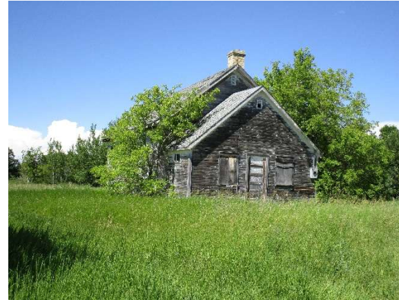
Poplar Park Area, Road 90N East of Road 33E GPS Reading: LAT N50.32840 / LONG W096.69504