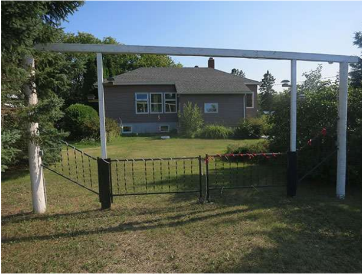
Libau Area, Road 35E at P.R. 317 GPS Reading: LAT N50.26896 / LONG W096.65071

Libau East School No. 1231, one of only three remaining one-room schoolhouses in St. Clements, is a fine example of period trends in schoolhouse design. Erected just to the east of the site of a predecessor that burned twice (the original 1903 school burned in 1906 and its successor succumbed in 1949), this roomy structure, with its well-lit classroom, was typical of a third generation in standardized rural schoolhouse design. Erected in 1952 (and replacing a granary that had been reworked after the 1949 building burned), the sturdy local landmark served scores of local children until consolidation in 1966, and then closure in 1967.