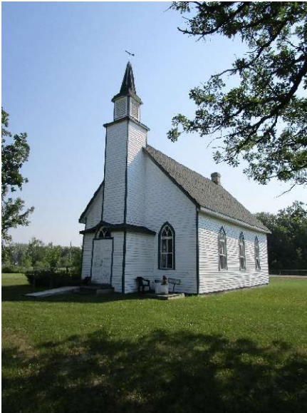
Poplar Park Area, Road 32E between Road 89N and 90N GPS Reading: LAT N50.32322 / LONG W096.72000