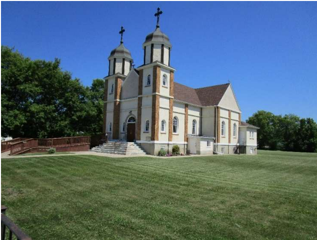
East Selkirk, Old Henderson Highway GPS Reading: LAT N50.13730 / LONG W096.83505