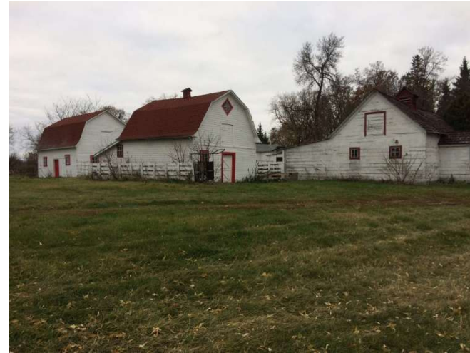
East Selkirk Area, Bunn Road GPS Reading: N 50° 8.435 W 96° 50.520

The Stewart Farm Site contains three small barns, which together are important reminders of the significance of farming activity in the municipality. Two of the barns are from the 1930s, and were moved to the site in the late 1950s in anticipation of the construction of the Red River Floodway. These are small market-garden sized buildings, large enough only for a cow or horse and some chickens. But they are typical of the type, with their distinctive gambrel roofs and minimal fenestration. The third barn has greater historical significance, dating to the early 1870s. Likely built for Thomas Bunn, whose fine stone house of 1861-64 stands nearby, the simple gabled roof belies its notable construction heritage – with walls of hewn log, the typical material approach used for buildings of that era.