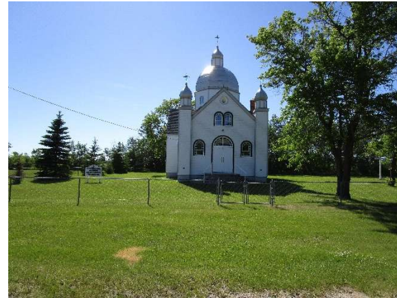
Thalberg Area, Road 43E North of Road 93N GPS Reading: LAT N50.37223 / LONG W096.46808

With its impressive range of domes and banyas (small domes), and elegant groupings of round-arched windows and openings, the architecture of Sts. Peter and Paul Ukrainian Catholic Church at Thalberg is a powerful reminder of the kind of historic Ukrainian architectural styles that were brought to the municipal context in the early decades of the 20th century by new Ukrainian immigrants. Built ca. 1920, this church is a major expression of those traditions and also of the determination of a local congregation to connect to their cultural roots.