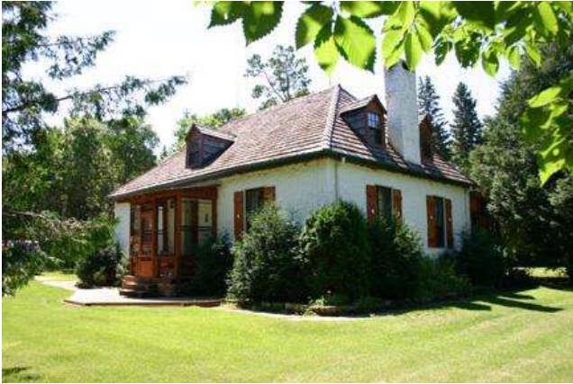
East Selkirk Area, Bunn Road GPS Reading: N 50° 8.435 W 96° 50.520