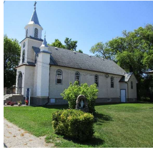
East Selkirk, Old Henderson Highway GPS Reading: LAT N50.13673 / LONG W096.83569

St. Stanislaus Kostka (Polish) Catholic Church stands as the major local site of the Roman Catholic faith in the municipality. That connection stretches back to 1897, with the arrival in the area of the first Polish immigrants. These proud and deeply religious settlers only were able to build their first church, a log chapel, in 1912. The building was by 1937 far too small for the growing congregation, and the present church was erected, and even enlarged in 1953. The building is a good example of Catholic architectural precepts, with its elegant towered façade and especially the use of round-arched doorways and window openings.