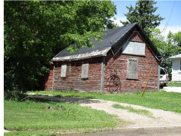
Libau, Road 86N at Road 32E GPS Reading: LAT 50.269156 / LONG 96.719468