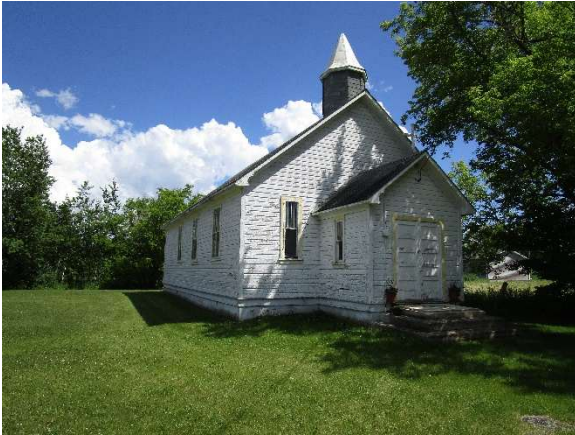
Libau, Road 32E North of Road 86N GPS Reading: LAT 50.271166 / LONG 96.720178

Libau Lutheran Church stands as the major historic site (dating to ca. 1925) of the Lutheran faith in the municipality (a larger but more modern Lutheran church stands near Thalberg). The Libau Lutheran Church is a typical small-town religious facility, with a simple boxy nave lit with windows on each side, and a basic gabled roof. But the architectural embellishments quickly establish its German-Scandinavian Lutheran roots: the octagonal shaft of the short steeple, the flat-topped windows, and especially the little wave-cresting details at the ends of the roof's bargeboards.